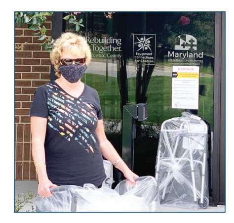
Neighbor Ride's volunteers are now delivering durable medical equipment in partnership with The Loan Closet.

As Neighbor Ride expands its services to respond to the needs of the most vulnerable in our community during the pandemic, your support of our Annual Giving Campaign is more important than ever. Please consider giving online at neighborride.org or via check to: Neighbor Ride - 5570 Sterrett Place, Suite 102 – Columbia, MD 21044.